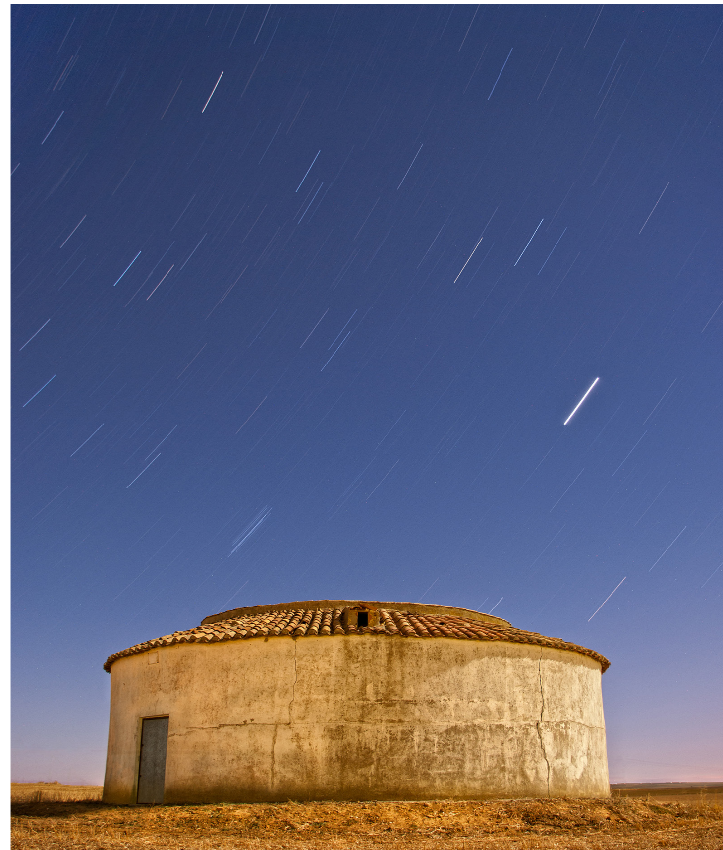
Traditional adobe pigeon-houses, Villalón Campos